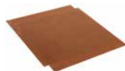
Non stick baking pad