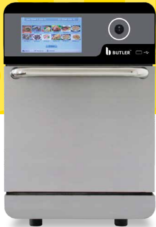
Concorde / Concorde Plus